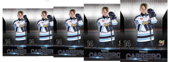
5 TRADING HOCKEY CARDS